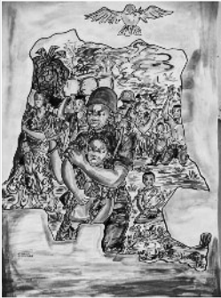
Photos from a workshop organised by HEAL Africa in Goma in August 2011, where young Congolese artists expressed their vision of a future for their country. They drew from historical