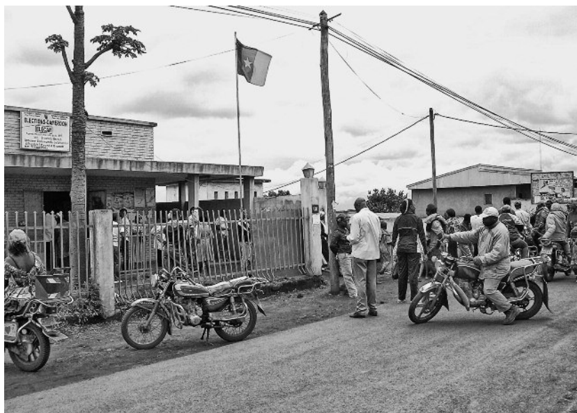
Citizens waiting in line in front of Elecam's Bafoussam 1 polling station

citizens and make them act as if they were deaf and blind to young people's actual concerns. Which contributes to discrediting political action. The future elected representatives should make a new pact with the citizens, all the citizens, especially young ones and not only with their voters or party comrades. Only such a pact could really create confidence and solidarity around shared values.